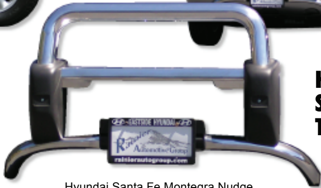
Hyundai Santa Fe Montegra Nudge Bar Combination