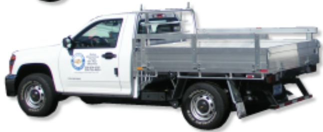
Ute Bed® or Ute Tray® with Stake-Sides Option