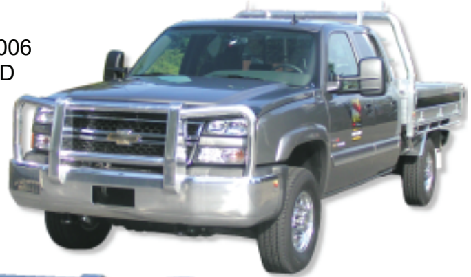
GM Silverado HD Model GM S1 BullBar™

(fits 2005-2006 Silverado HD 2500-3500 and other models TBA)