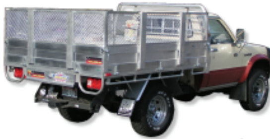
Ute Bed® or Ute Tray® with Screen-Sides Option