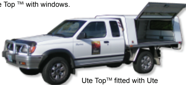
Ute Top™ fitted with Ute Tray® on Nissan Frontier.