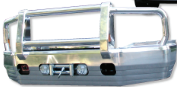
Ford SuperDuty BullBar™ 1999-2004 F250-550 Excursion