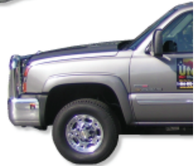
GM Silverado HD Model GM S1 BullBar™