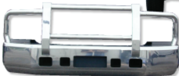
Ford SuperDuty BullBar™ 2005-2006 F250-550 Excursion