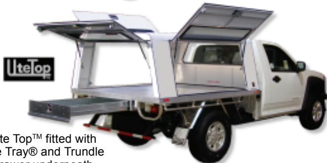
Ute Top™ fitted with Ute Tray® and Trundle Drawer underneath. Ute Top™ with windows.