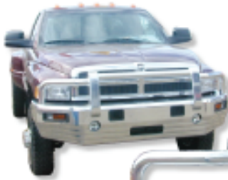
Dodge Ram BullBar™ 2nd Generation

**2006 Ram is 3rd Generation Ram with a conversion kit. Includes end caps and moldings under headlights.