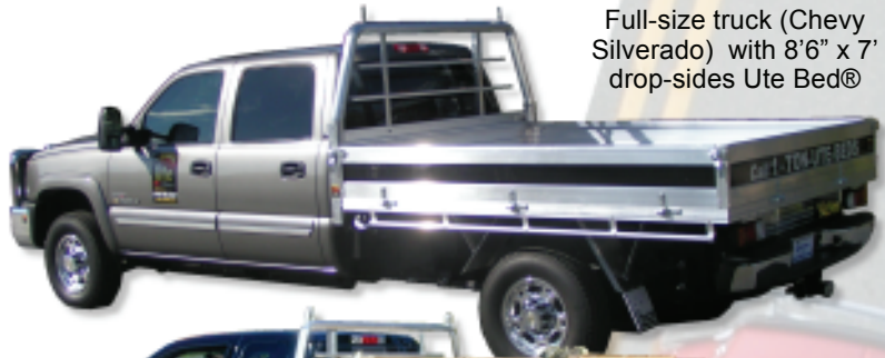
Full-size truck (Chevy Silverado) with 8'6" x 7' drop-sides Ute Bed®

(single rear wheel only) Chevy Silverado, Ford SuperDuty and Dodge Ram 8'6" x 7' bed - FTT70806