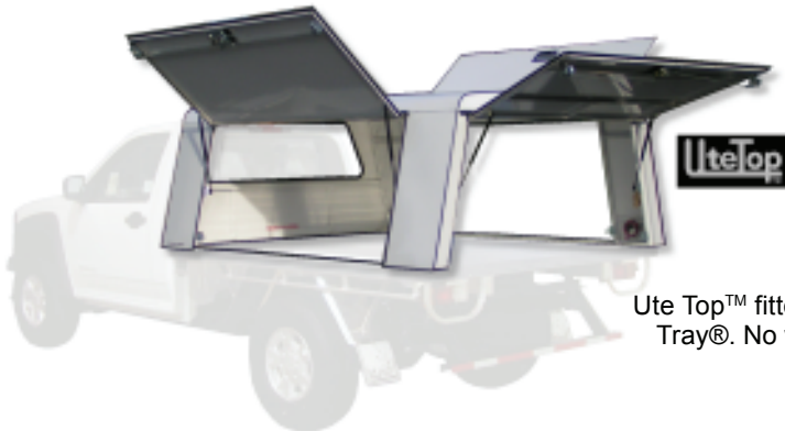
Ute Top™ fitted with Ute Tray®. No windows.