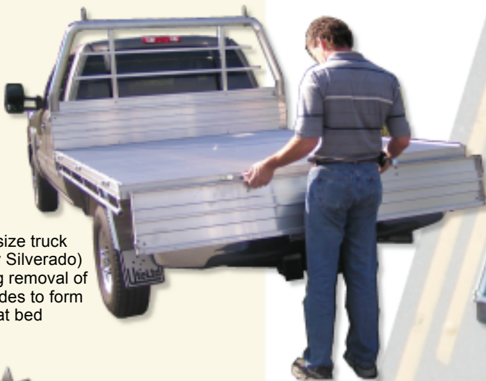
Full-size truck (Chevy Silverado) showing removal of drop-sides to form flat bed