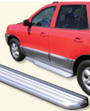
Hyundai Santa Fe Running Boards