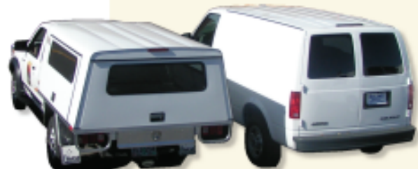
72" side to side