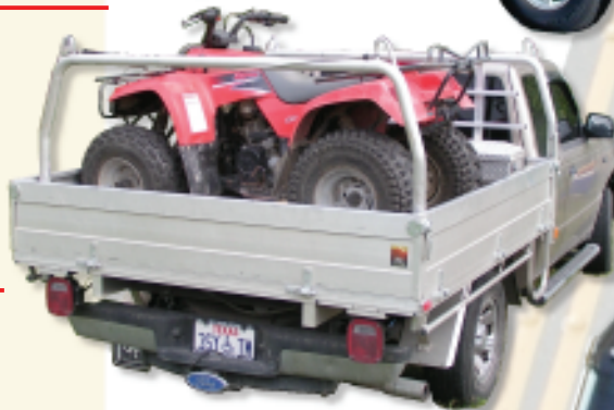
Medium-size truck (Ford Ranger) with 6'8" x 6' drop-sides Ute Bed®