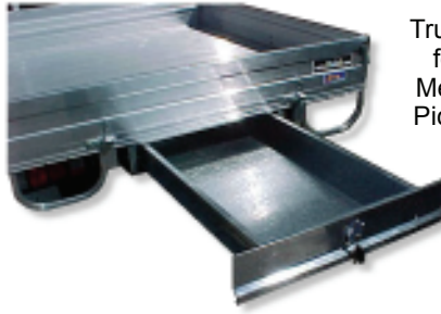
Trundle Drawer for Small to Medium-Sized Pick-up Trucks