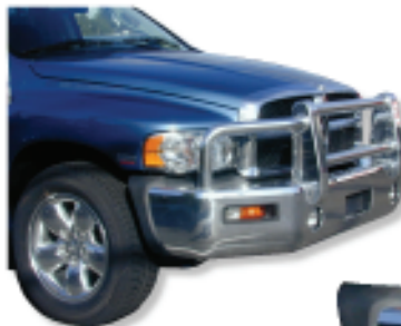
Dodge Ram BullBar™ 3rd Generation

(fits 2002 model 1500 and 2003-2006 Ram 1500-3500)