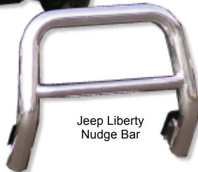
Jeep Liberty Nudge Bar