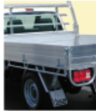
Rear Step Light Protector