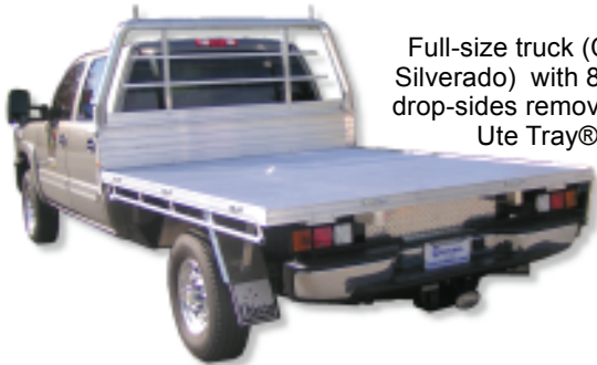
Full-size truck (Chevy Silverado) with 8'6" x 7' drop-sides removed and Ute Tray®