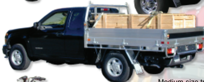
Medium-size truck (Chevy Colorado) with 6'8" x 6' drop-sides Ute Bed®