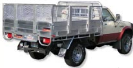
Ute Bed® or Ute Tray® with Screen- Sides Option