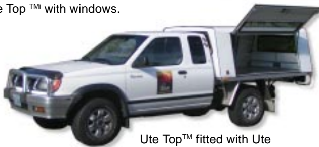
Ute Top™ fitted with Ute Tray® on Nissan Frontier.