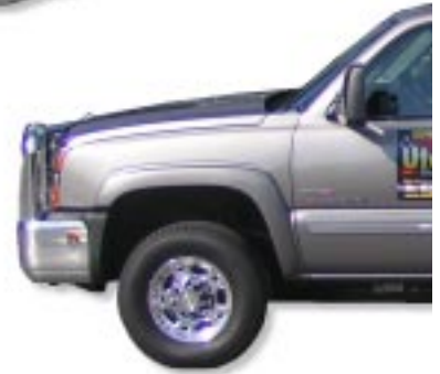
GM Silverado HD Model GM S1 BullBar™