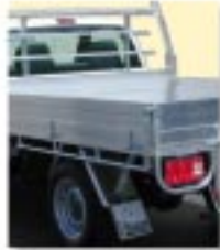
Rear Step Light Protector