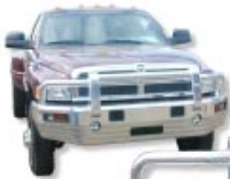
Dodge Ram BullBar™ 2nd Generation

**2006 Ram is 3rd Generation Ram with a conversion kit. Includes end caps and moldings under headlights.