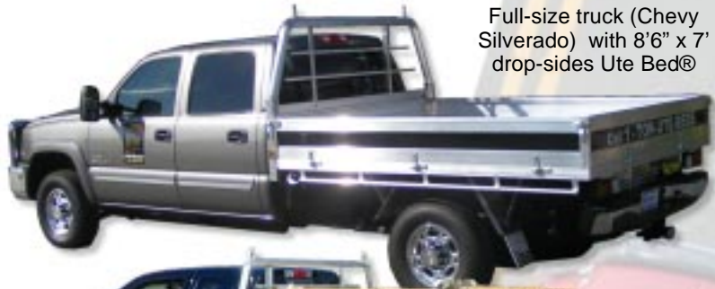
Full-size truck (Chevy Silverado) with 8'6" x 7' drop-sides Ute Bed®

(single rear wheel only) Chevy Silverado, Ford SuperDuty and Dodge Ram 8'6" x 7' bed - FTT70806