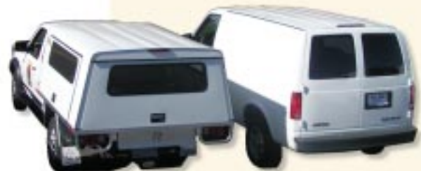
72" side to side