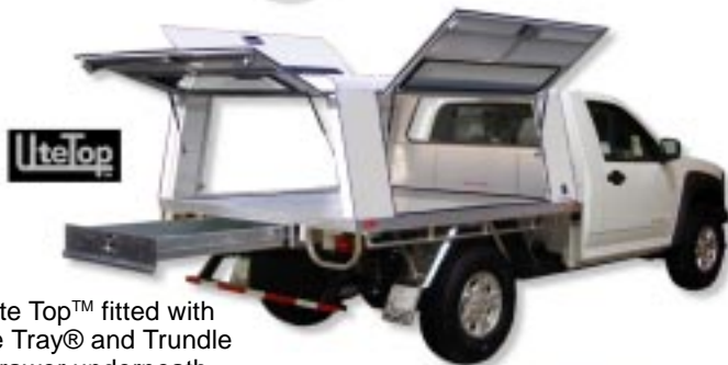
Ute Top™ fitted with Ute Tray® and Trundle Drawer underneath. Ute Top™ with windows.