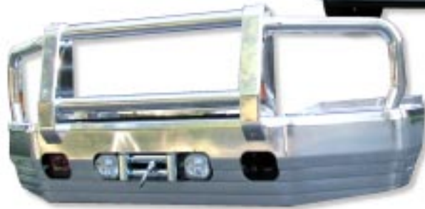
Ford SuperDuty BullBar™ 1999-2004 F250-550 Excursion

The very latest technology -- uncompromised strength, refined styling and valuable protection. High grade, brightly polished aluminum construction is lightweight, yet strong. Stylish urban design enhances your vehicle's appearance, while providing valuable protection for your vehicle. Does not interfere with the vehicle's carefully engineered crumple zones which are designed to dissipate energy to protect occupants. Crash-tested for air-bag compliance. Winch-mount option available.