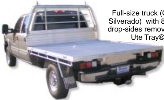
Full-size truck (Chevy Silverado) with 8'6" x 7' drop-sides removed and Ute Tray®