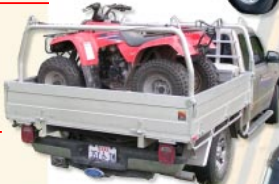
Medium-size truck (Ford Ranger) with 6'8" x 6' drop-sides Ute Bed®