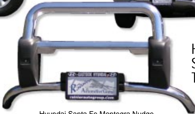
Hyundai Santa Fe Montegra Nudge Bar Combination