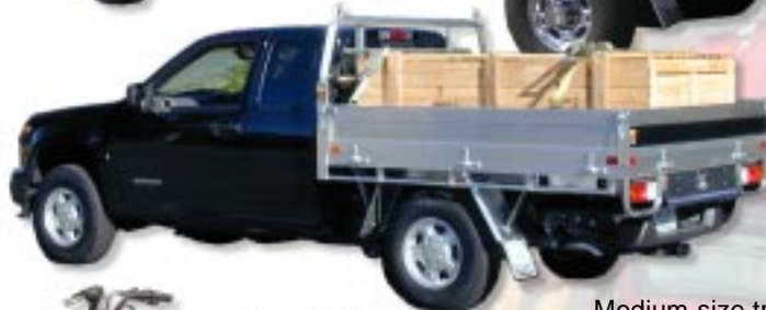
Medium-size truck (Chevy Colorado) with 6'8" x 6' drop-sides Ute Bed®