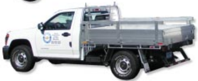
Ute Bed® or Ute Tray® with Stake- Sides Option