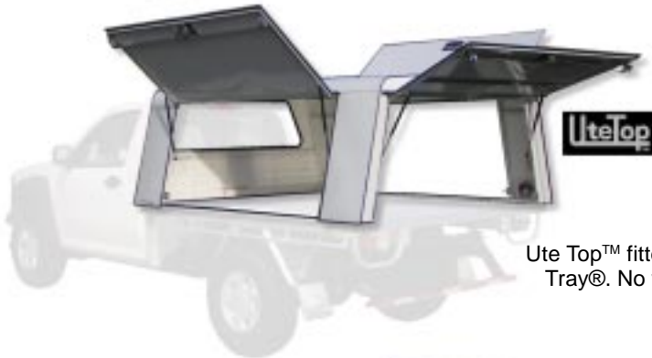
Ute Top™ fitted with Ute Tray®. No windows.