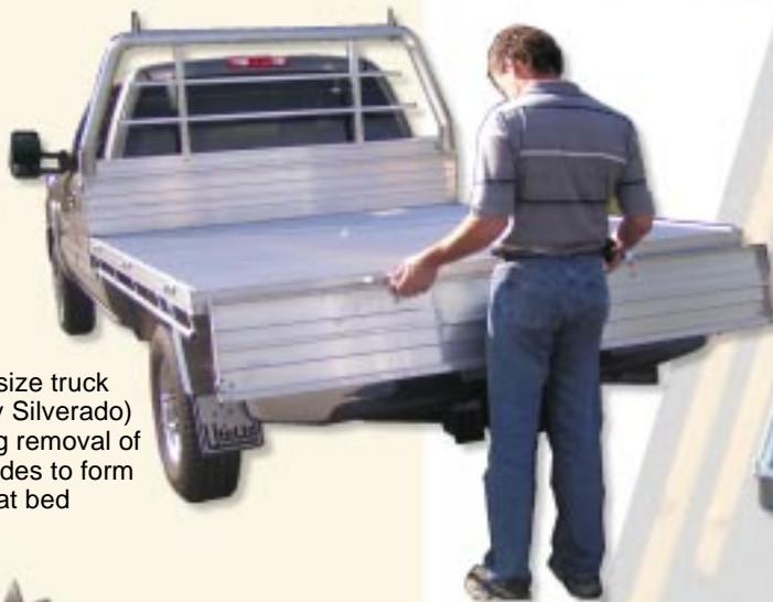
Full-size truck (Chevy Silverado) showing removal of drop-sides to form flat bed