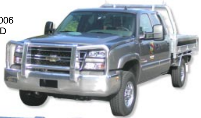
GM Silverado HD Model GM S1 BullBar™

GM S1 (fits 2005-2006 Silverado HD 2500-3500 and other models TBA)