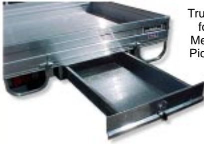
Trundle Drawer for Small to Medium-Sized Pick-up Trucks