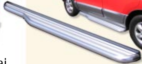
Hyundai Santa Fe Running Boards