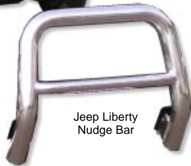
Jeep Liberty Nudge Bar