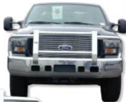
Ford SuperDuty BullBar™ 2005-2006 F250-550 Excursion