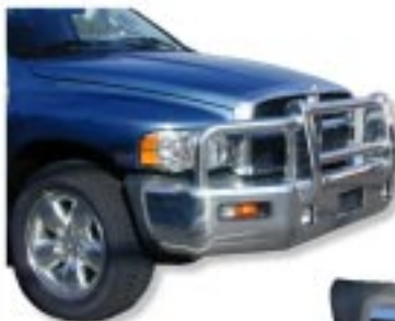
Dodge Ram BullBar™ 3rd Generation